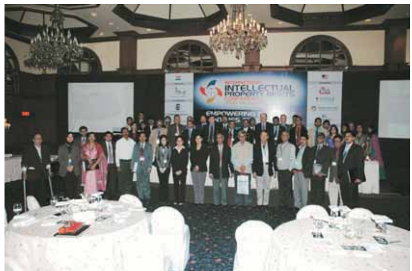
1st INTERNATIONAL CONFERENCE Date – January 29 & 30, 2010 Venue – Hotel Taj Bengal, Kolkata Theme: EMPOWERING BUSINESS ENTITIES THROUGH IPR