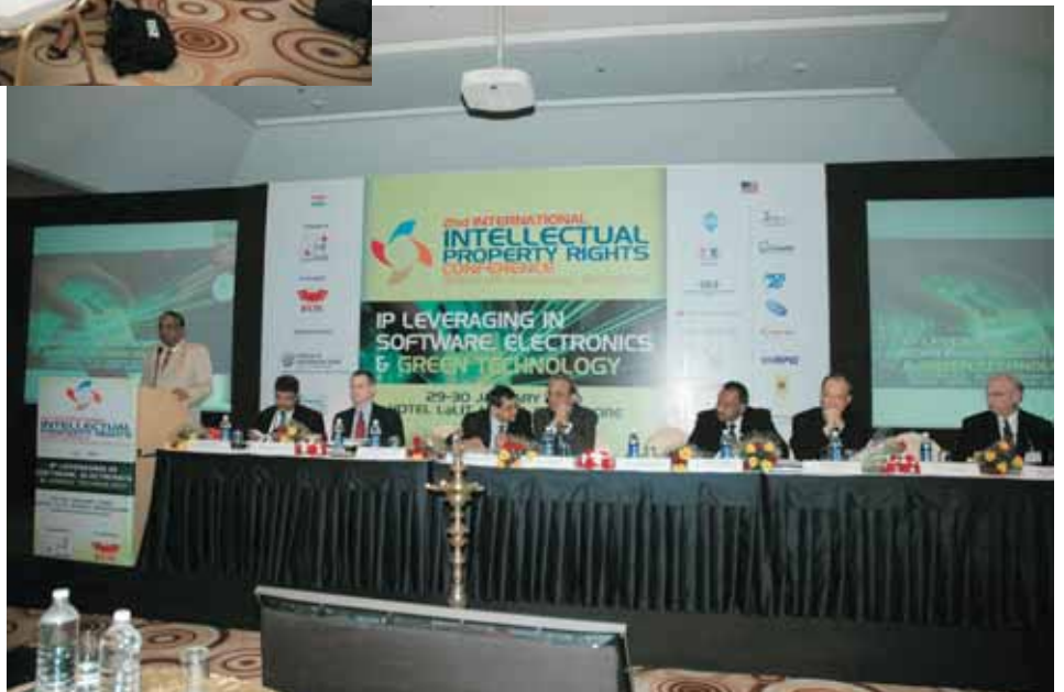
2nd INTERNATIONAL CONFERENCE Date – January 29 & 30, 2010 Venue – Hotel The LaLit Ashok, Bangalore Theme: IP LEVERAGING IN SOFTWARE, ELECTRONICS & GREEN TECHNOLOGY