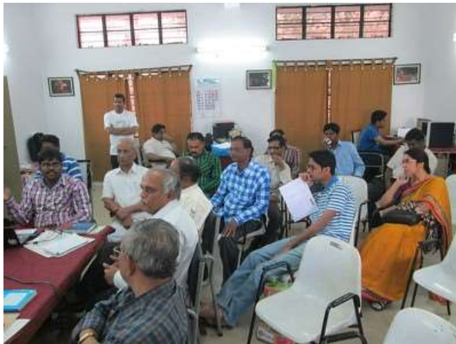
Pictured above participants at the Tewiki Hackathon 2014