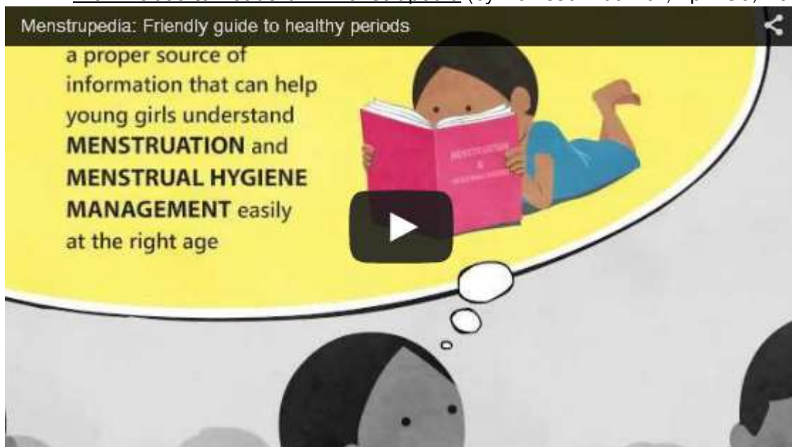
A screen shot of a video giving readers the facts of menstrupedia.