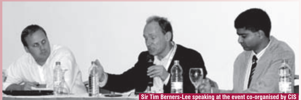
Sir Tim Berners-Lee speaking at the event co-organised by CIS

CIS participated in the 2009 Internet Governance Forum (IGF) in a number of ways: