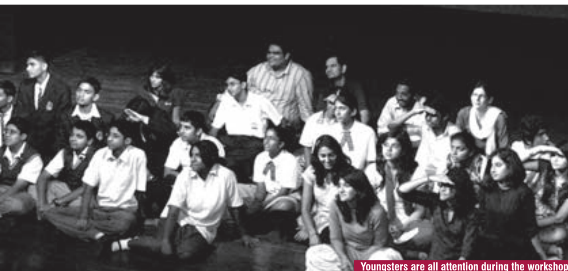
Youngsters are all attention during the workshop

Hivos is particularly interested in the systemic changes that these Digital Natives, as e-agents of change, induce in their socio-cultural and political environments and has partnered with CIS to assess the state of knowledge on the intersection between youth, ICT and engagement worldwide and with a specific attention for developing countries.