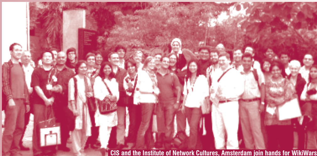
CIS and the Institute of Network Cultures, Amsterdam join hands for WikiWars