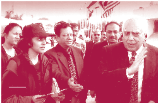
Kapil Sibal, Minister of HRD, Govt of India, receives invitation for the R2R campaign