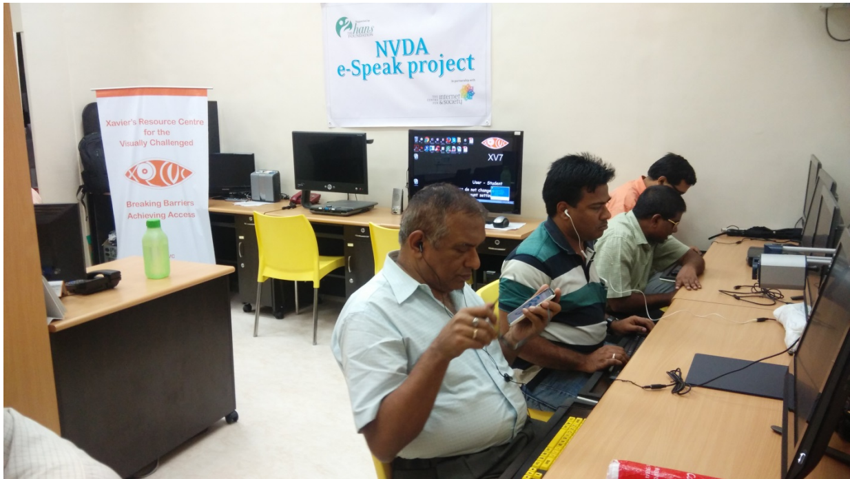
Pictures of Touch screen user training with android and E-speak TTS on 25 th June 2016