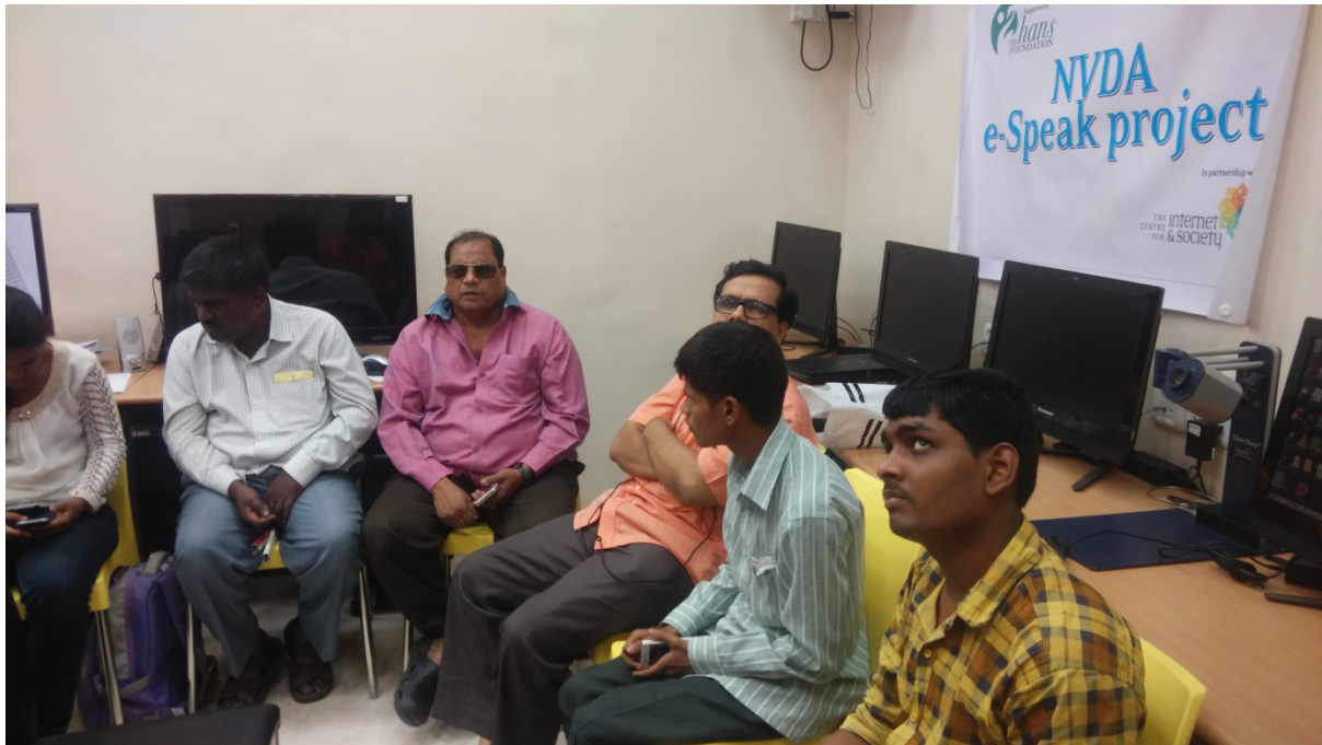
Pictures of Training for data transfer using NVDA and E-Speak on to portable devices and file management using NVDA and E-Speak on 27 th June 16