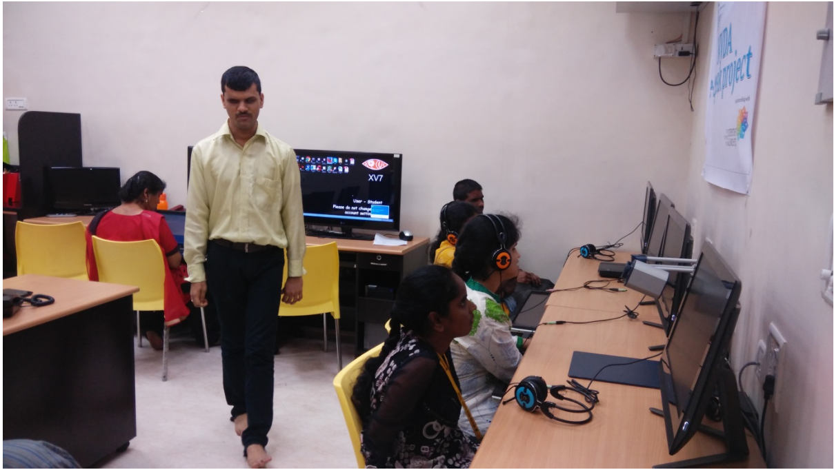
Pictures of Basic "Internet & Email Workshop" with NVDA / E-speak Workshop on 19 th June 2016