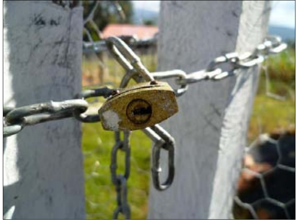
Librarians and digital natives have the key to "open the door"

ibraries are changing, they are no longer book warehouses covered with dust and spiderwebs, they are neither those places were children were sent when punished, but instead are becoming a more dynamic space that serves the needs of its users.