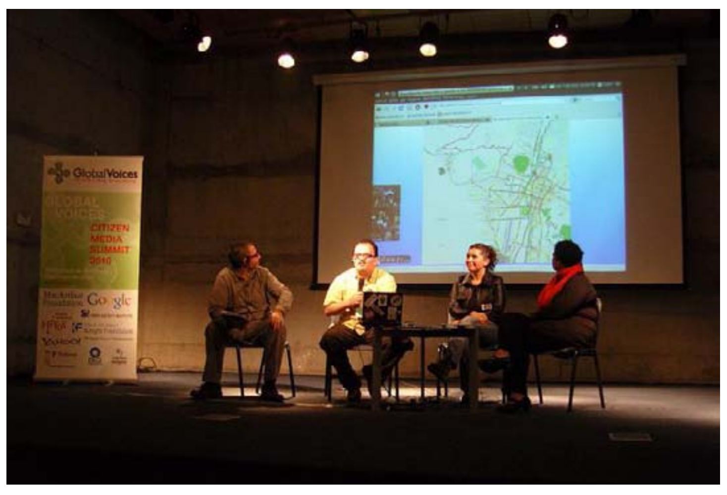
Librarians in action at GV Summit 2010