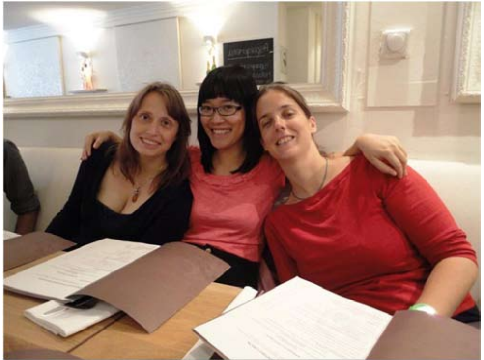
The Hivos Ladies

““To be without you, is like facebook without friends, myspace without bands, google with no results.” “Your name must be Google, because you’ve got everything I’ve ever searched for.” “Your homepage or mine?”