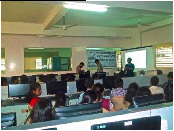
A picture of students doing wiki editing at the Odia Wikipedia workshop