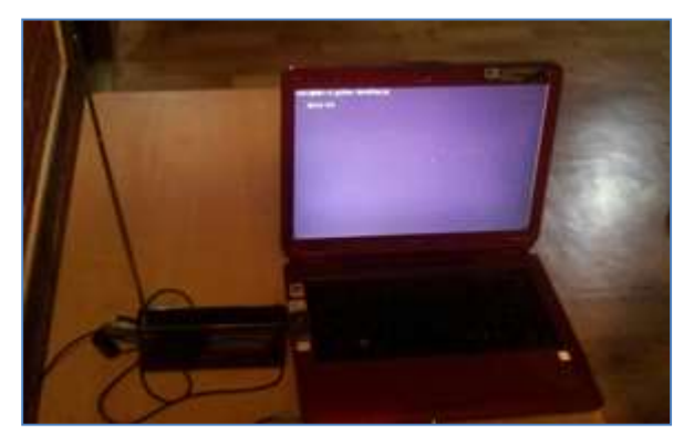
Above is the image of a portable FM receiver hooked up to the Mic input of a laptop. Another laptop's audio line-out was connected to an FM transmitter.