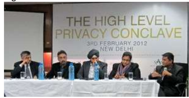
Panelists at the High Level Privacy Conclave

The All India Privacy Symposium (India International Centre, New Delhi, February 4, 2012): The symposium was organised around five thematic panel discussions: privacy and transparency, privacy and e-governance initiatives, privacy and national security, privacy and banking and health privacy. Privacy India in partnership with CIS, International Development Research Centre, Privacy International, Commonwealth Human Rights Initiative and Society in Action Group organised this event.