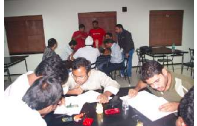
Above is a picture of the participants exploring the mobile devices at the event held in TERI

A Workshop on "Exploring the Internals of Mobile Technologies" (TERI Southern Regional Centre 4th Main, Domlur II Stage Bangalore, October 27, 2012): On October 27, 2012, the Centre for Internet & Society (CIS) organised a one-day workshop on exploring the internals of mobile technologies at the TERI Southern Regional Centre in Bangalore. The workshop received more than 140 registrants, of which approximately 40 attended.