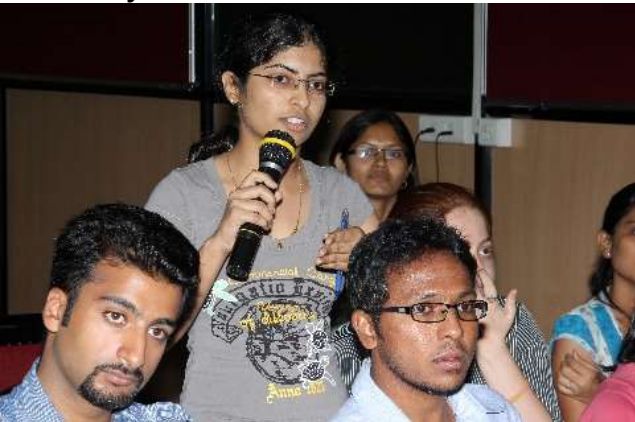
Participants asking questions during the Pune conference