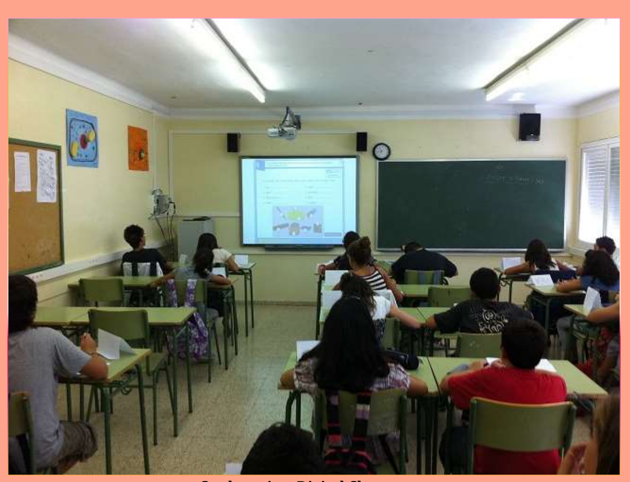
Students in a Digital Classroom