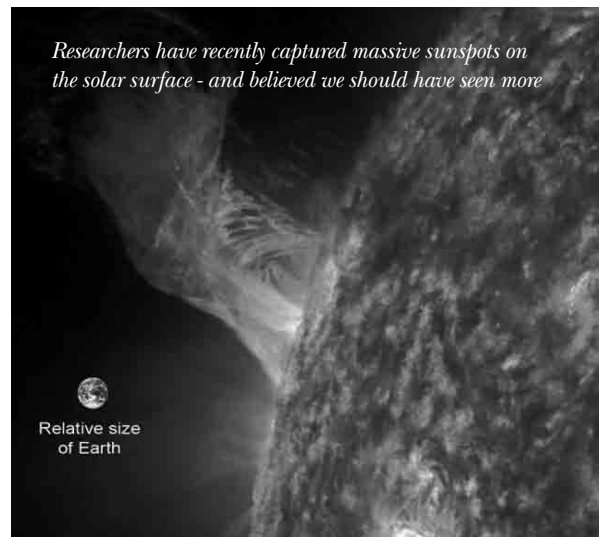
Researchers have recently captured massive sunspots on the solar surface - and believed we should have seen more

If the two cycles are twins, 'it would mean one peak in late 2013 and another in 2015'.