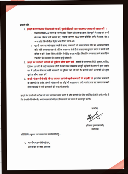
Img 9: The Fraazo workers submitting their complaints to the Deputy Labour Commissioner, Gautam Budh Nagar, 2 July 2022 (L) demanding a restoration of their old payout system (R)