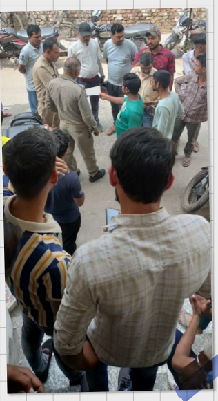
Img 4: Workers picketing the store after a failed meeting with the legal head (L) and police constables trying to break up the strike (R)

As the union rep and workers waited to speak with the ACP, the Fraazo legal head went into his chambers and falsely accused the peacefully striking workers of disrupting store operations and harassing the store managers. The matter was forwarded to a sub-inspector (SI) at the same police station, who called both parties to put forth their case.