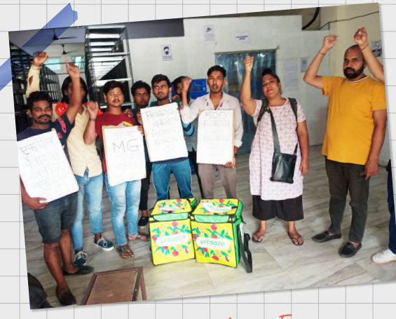
Img 7: A shut-down Fraazo store in Indirapuram (l) and Noida (R) on July 1, 2022