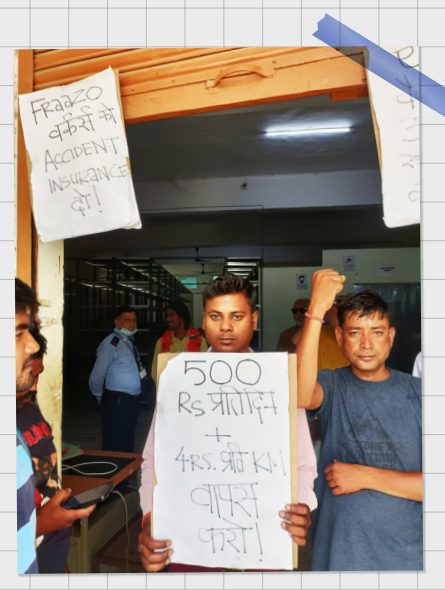
Img 3: Fraazo delivery workers picketing a store in Indirapuram, Ghaziabad (L) and Noida (R) with their strike demands. May 30, 2022

In an informal discussion with the delivery workers from different stores, the legal head pointed out that workers had 'signed a contract' (a 10-page 'terms and conditions' document in English that no one had been allowed to read at the time of joining), which stipulated that they have to adhere to changes in their payout structures or service conditions as per company directives. When the workers challenged the